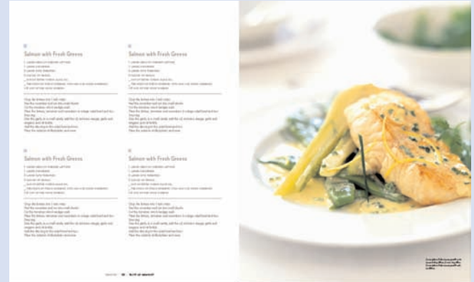
Sample Recipe Spread for Taste of Newport Cookbook '08

We see the production of the Taste of Newport Cookbook as a way to spread the word about Child & Family, Taste of Newport, and the incredible culinary choices to be had in Newport County and beyond. The book will be printed and ready for distribution by November 9, 2008, which is the scheduled date for the 25th annual Taste of Newport. Proceeds from the sale of this book will benefit Child & Family.