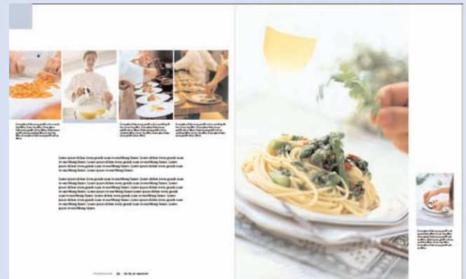
Sample Food Preparation Spread for Taste of Newport Cookbook '08