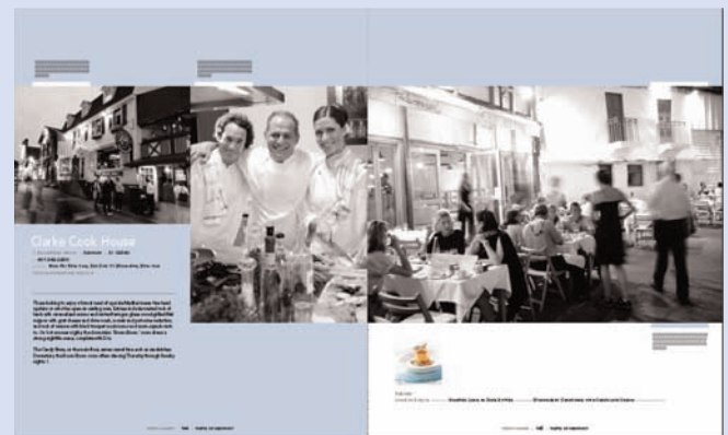
Sample Restaurant Spread for Taste of Newport Cookbook '08